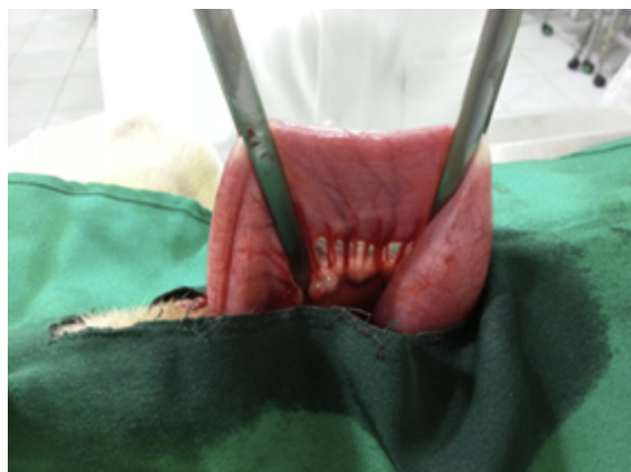
Fig. 1 – Colon identified at 20 cm from the anal margin and secured with a straight intestinal clamp.

6 and 12 h respectively during the first 24 h after the procedure. Meloxicam (0.2 mg/kg s.c.) was done every 12 h for 3 days and Tramadol (2 mg/kg i.m.) was administered preoperatively and at each 4 h during the first 24 h after the procedure. Following anesthesia with propofol (5 mg/kg i.v.) and orotracheal intubation, the animals were placed on mechanical ventilation with isoflurane in a semi-closed circuit. The anesthetized animals were submitted to digital rectal examination to evaluate the bowel preparation according to the classification of O'Dwyer et al. 9 (excellent=no feces; good=minimal fecal residue; acceptable=liquid feces; soiled=solid feces). The grading was confirmed during the surgical procedure. Subsequently, the animals were placed in dorsal decubitus and the laparotomy was performed through a transumbilical, median incision measuring approximately 12 cm. The abdominal cavity was inspected to rule out hematogenic or gynecological disorders. Initially, the descending colon was identified at 20 cm from the anal margin and secured with a straight intestinal clamp (Fig. 1).