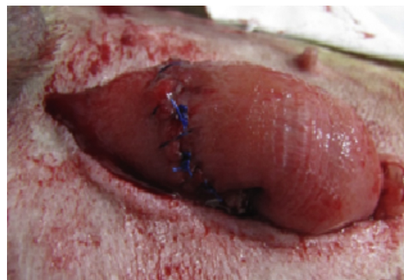
Fig. 2 – The animals from Group I, submitted to colo-colic anastomosis with a single-layer running suture using polypropylene 000.

The findings were statistically analyzed using Student's t test (non-paired samples, parametric data) and the