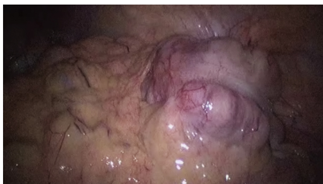
Fig. 4 – Laparoscopic view identifying colonic mass in the ascending colon located on the left of abdominal cavity.

The mesentery was incised caudal to the ileocolic vessels. A mesenteric window below the vessels was created searching the second part of duodenum. The ileocolic vessels were divided at its root after superior mesenteric vessels were exposed and radical lymphadenectomy around this area