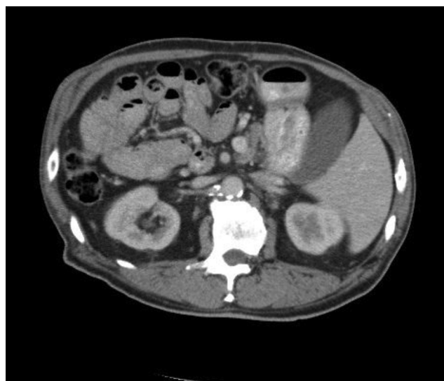
Fig. 2 – Abdominal computed tomography showed a colonic mass located in ascending colon, which was inverted on the left side.