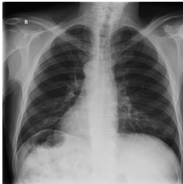
Fig. 1 – Chest X-ray showed dextrocardia and right-sided gastric air bubble.

According to the findings above laparoscopic hemicolectomy was performed under general anesthesia in a lithotomy position tilted to the right and with his head down. The surgeon and the second assistant were situated at the right side of the patient and the first assistant was positioned on the left, which are opposite the positions used for a normal patient. Pneumoperitoneum was established above umbilicus using a Hasson trocar (12 mm optical trocar) for the camera inserted by open technique under direct vision. Trocars were placed in a mirror manner including a 12 mm trocar in the right iliac