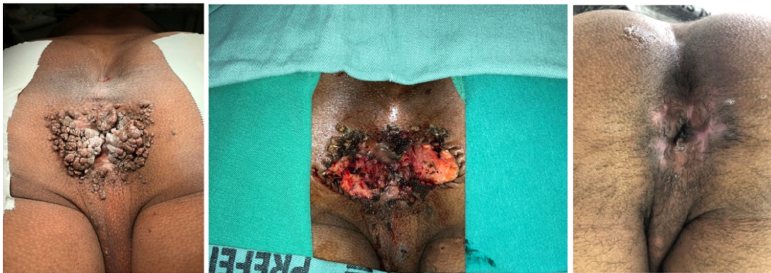
Fig. 5 – Extensive perianal lesion refractory to topical clinical treatment; second surgery; and current final aspect.