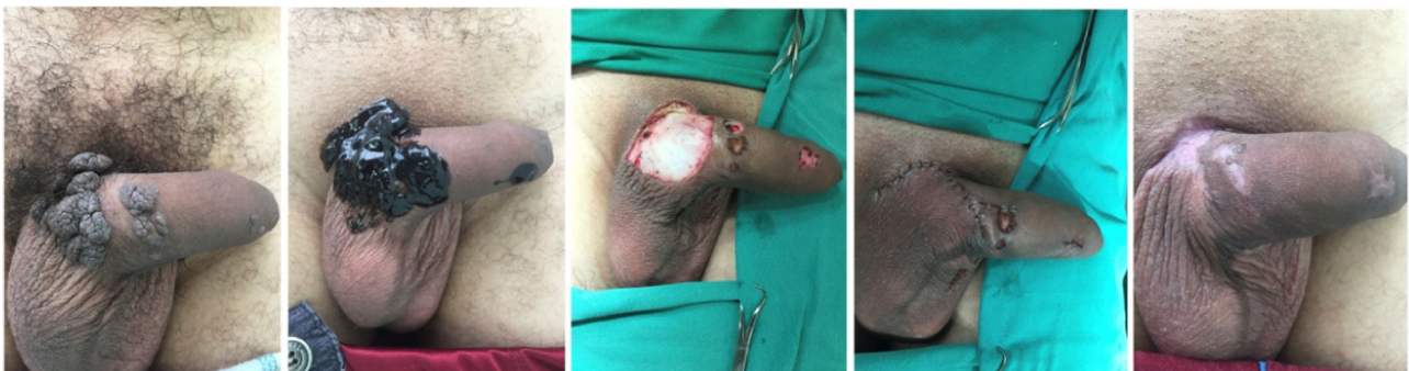
Fig. 6 – Condylomatous lesion on genitalia; application of podophyllin 25%; surgical excision; operative aspect; and current aspect.

This case is similar to the previous one, because it was also a case of condylomatous lesions in a young male patient that was also refractory to treatment with a topical chemical agent, requiring surgical excision. The divergence in the latter two cases was the affected site.