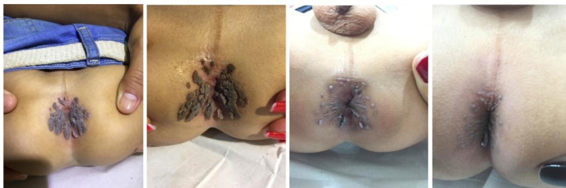
Fig. 2 – Good clinical evolution with the use of a topical chemical agent that is very well tolerated by children.