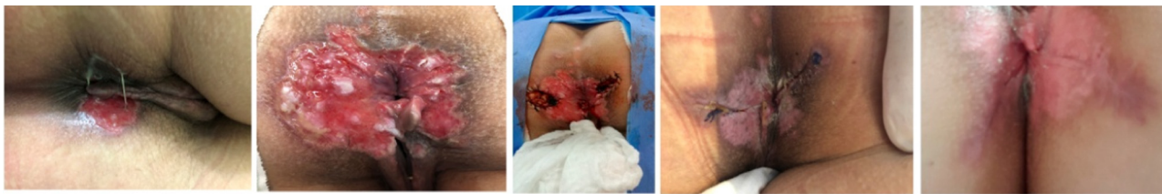
Fig. 1 – Progression of the lesion in a short interval of time; the operative act; and outpatient follow-up.