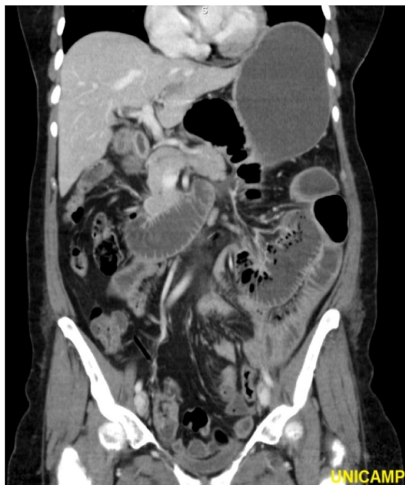
Fig. 3 – CT with reformatted image. Coronal section where ascending vessels are identified, strongly grouped, indicating mesocolon defect level, with multiple redundant loops of the small intestine in the upper left quadrant. It is also evidenced intestinal obstruction with segmental dilatation and liquid stasis proximal to the obstruction site.

proximal to the point of obstruction with marked gastric stasis obstruction (Fig. 3).