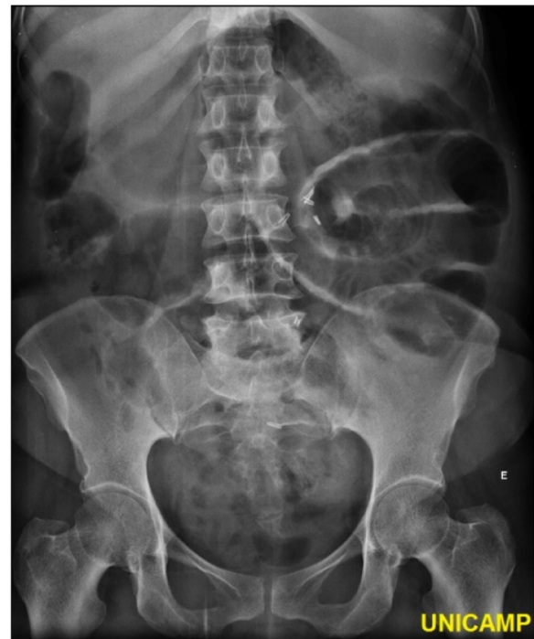
Fig. 2 – Simple abdominal radiograph showing dilated loops of the small intestine (jejunum) with visible convex valves, located mainly in the upper left quadrant.

On the 1st postoperative, the patient walked without help and accepted oral liquid diet. On the 3rd postoperative after accepting mild diet and eliminate gases and received hospital discharge. On 5th postoperative day, she returned to the hospital emergency room, complaining about severe abdominal colic, accompanied by vomiting, stopping the gas and stool elimination. Physical examination showed no fever, but she was tachycardiac and dehydrated. The abdomen was painful to palpation, distended, but without signs of peritoneal irritation. With suspicion of intestinal obstruction, a radiographic series of the abdomen was performed, which showed suggestive signs of intestinal obstruction: dilated small intestine loops with visible convex valves, grouped mainly in the upper