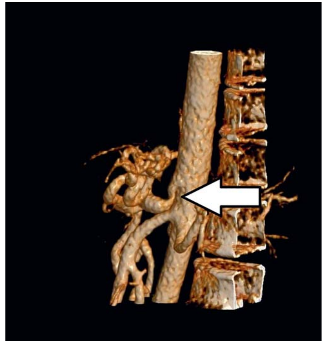
► Fig. 1 Prior to transarterial chemoembolization (TACE), four-dimensional CT angiography (4D-CTA) volume-rendering technique (VRT) images of a 73-year-old male patient with colorectal liver metastases were reconstructed (seconds after initiation of contrast injection: 22.5 s). The lateral view of the reconstructed VRT series reveals a steep origin of the celiac trunk, possibly facilitating catheter selection. Furthermore, stenosis of the celiac trunk is also depicted (arrow).

Although the pathophysiological mechanism of CIN is not sufficiently clarified yet [21], the vast majority of clinical studies describe a lower incidence of CIN in patients receiving contrast material intra-venously rather than intra-arterially [22, 23]. In this regard, not so much osmolality as higher viscosity during intra-arterial injection was presumed to be a potential explanation [16, 18]. On the contrary, in a recent study, the incidence of CIN following TACE of HCC seemed to be comparable to that after intra-venous contrast media administration [12]. However, as long as this issue remains a topic on the ongoing controversial investigation, we consider especially a reduction of the intra-arterial fraction of administered contrast media as desirable, to enhance patient safety and minimize the risk of CIN. In routine clinical practice, radiologists and other treating clinicians should be aware of the option of optimizing contrast material consump-