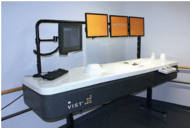
► Fig. 1 Stationary simulator (VIST LAB).