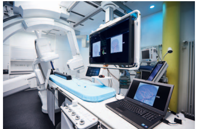
► Fig. 3 Integration of the simulator in an angiography suite.