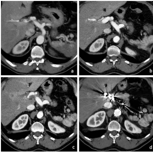
► Fig. 1 a Initial CT showing aneurysm of the common right and left, with wall-adherent thrombi. Also visible is a large dissection of the splenic artery with splenic infarction. b CT follow-up after 3 months shows progressive enlargement of the hepatic arteries with thrombus dissolution. The proximal splenic artery is occluded. The spleen is already atrophied. c 6 months after the initial CT examination, progressive enlargement of the aneurysm with extensive wall thrombosis and impaired perfusion in liver segments II/III are seen. d 3 years after coil embolization and stent graft of the celiac trunk, the entire trunk vessel segment is occluded and the size of the hepatic aneurysms has decreased. The liver continues to be well perfused by tributaries.

tery was excluded in three cases. Normal liver function and an open portal vein were required for embolization. In one of these cases, the entire vascular bed of the celiac trunk was excluded by placing a stent graft over the orifice of the celiac trunk in addition to performing coil embolization due to a dissected aneurysm of the trunk (► Fig. 2 ). Due to arterioportal fistulas that occurred during the intervention, retrograde portal-venous perfusion of the trunk was seen for up to 1 year post-intervention and thrombosis only occurred subsequently.