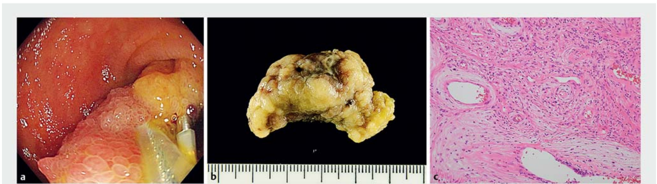
► Fig. 2 Endoscopic treatment and pathological diagnosis. a A clip-assisted snare polypectomy was performed, with no complications. b Gross examination showed a 40-mm polyp with ulceration. c Pathological examination showed fibroblast proliferation and vessels infiltrated with inflammatory cells, including eosinophils.