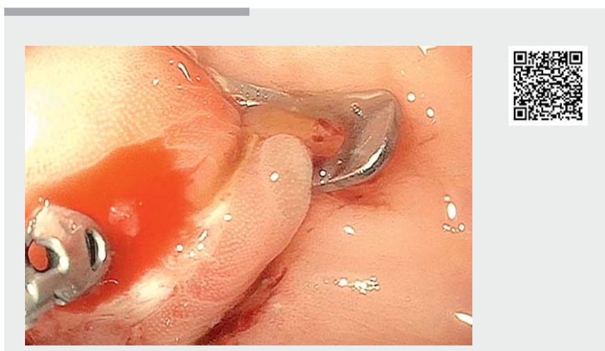
► Video 1 An over-the-scope clip (OTSC) placed for a large colonic perforation was complicated by delayed bleeding despite its known hemostatic mechanical effect.