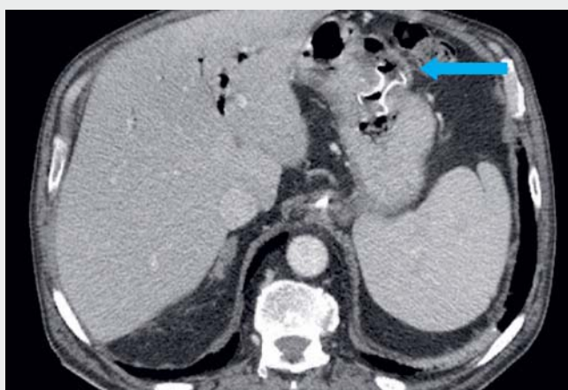
▶ Video 1 Endoscopic ultrasound-guided transgastric drainage of an abdominal abscess is performed using a lumen-apposing metal stent. The stent is removed 10 days later, after resolution of the collection, and an over-the-scope clip is placed to close the gastric hole, with hemostasis being achieved with injection of tissue glue.