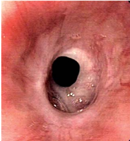
► Fig. 1 Nonulcerated esophageal stricture in the lower part of the esophagus.

A 25-year-old man presented with a history of dysphagia after corrosive ingestion. Upper gastrointestinal (GI) endoscopy revealed a stricture in the lower esophagus (► Fig. 1 ), which persisted after repeated sessions of endoscopic dilatation. As a rescue treatment, a fully covered self-expandable metallic stent, 18 mm in diameter, was placed in the lower esophagus. To prevent slippage and migration of the stent, a novel technique was used to fix the stent to esophageal wall (► Video 1 ). The proximal end of the stent was fixed to the esophageal wall with clips. The procedure was performed under moderate sedation with Propofol. After submucosal injection with normal saline (stained with indigo carmine) at the proximal end of the stent, a vertical mucosal incision of 1 cm was made with a triangular tip knife (► Fig. 2 ), and the mucosa distal to the incision was fixed to the stent by application of a hemoclip (► Fig. 3 ). Two clips were applied, one each at the 12 and 6 o'clock position, which fixed the stent to the esophageal wall (► Fig. 4 ). The whole procedure was well tolerated without any complication. After 4 weeks of follow-up, the stent was in situ and the patient asymptomatic.