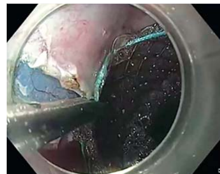
► Fig. 3 Application of hemoclip to fix the stent to the mucosa.

Fully covered metal stents are being increasingly used for the benign esophageal diseases [1], however stent migration is not uncommon, and a migration rate of more than 30% has been reported [2]. Various methods such as suturing [3], external fixation with snare [4], and nasal fixation with silk thread [5] have been described. Hemoclips have been used previously to prevent migration [2] and reduced migration to 13%. Fixing the clips after mucosal incision may better anchor the stent to the esophageal