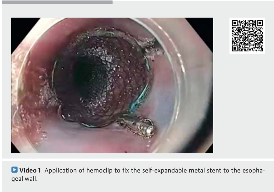
► Video 1 Application of hemoclip to fix the self-expandable metal stent to the esophageal wall.

A 25-year-old man presented with a history of dysphagia after corrosive ingestion. Upper gastrointestinal (GI) endoscopy revealed a stricture in the lower esophagus (► Fig. 1 ), which persisted after repeated sessions of endoscopic dilatation. As a rescue treatment, a fully covered self-expandable metallic stent, 18 mm in diameter, was placed in the lower esophagus. To prevent slippage and migration of the stent, a novel technique was used to fix the stent to esophageal wall (► Video 1 ). The proximal end of the stent was fixed to the esophageal wall with clips. The procedure was performed under moderate sedation with Propofol. After submucosal injection with normal saline (stained with indigo carmine) at the proximal end of the stent, a vertical mucosal incision of 1 cm was made with a triangular tip knife (► Fig. 2 ), and the mucosa distal to the incision was fixed to the stent by application of a hemoclip (► Fig. 3 ). Two clips were applied, one each at the 12 and 6 o'clock position, which fixed the stent to the esophageal wall (► Fig. 4 ). The whole procedure was well tolerated without any complication. After 4 weeks of follow-up, the stent was in situ and the patient asymptomatic.