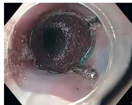
► Fig. 4 Fixation of esophageal stent to the esophageal wall.

Fully covered metal stents are being increasingly used for the benign esophageal diseases [1], however stent migration is not uncommon, and a migration rate of more than 30% has been reported [2]. Various methods such as suturing [3], external fixation with snare [4], and nasal fixation with silk thread [5] have been described. Hemoclips have been used previously to prevent migration [2] and reduced migration to 13%. Fixing the clips after mucosal incision may better anchor the stent to the esophageal