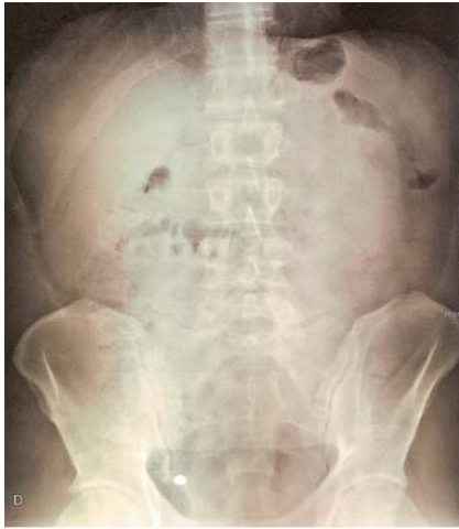
► Fig. 1 Abdominal X-ray showing a radiopaque image in the right inferior quadrant.