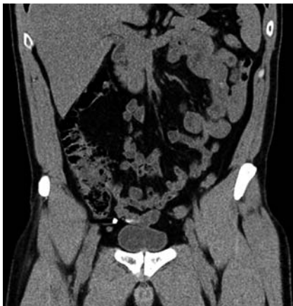
► Fig. 2 Abdominopelvic computed tomography scan showing a metallic-density image apparently within the cecal appendix without evidence of an inflammatory process.

A healthy and asymptomatic 38-year-old man presented with accidental foreign body ingestion. The abdominal X-ray showed a radiopaque image in the right inferior quadrant (► Fig. 1 ). An abdominopelvic computed tomography (CT) scan was performed and showed a metallic-density image apparently within the