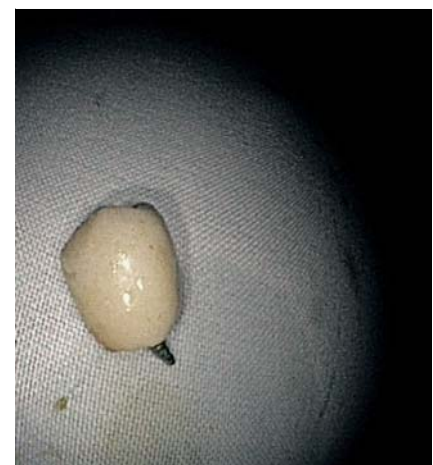
► Fig. 3 Dental implant retrieved from the appendix.

Foreign bodies in the appendix have been described and complications such as acute appendicitis and appendiceal abscess can occur, especially with sharp, stiff, and metallic objects [1]. Endoscopic removal of the object has been suggested when an object is identified in the appendiceal orifice and there is no evidence of inflammation or other complication [2]. Clinical and imagiological follow-up is also an option, and some patients will have spontaneous expulsion of the object [3]. Nonetheless, surgery is indicated when endoscopic or spontaneous removal is not possible or when