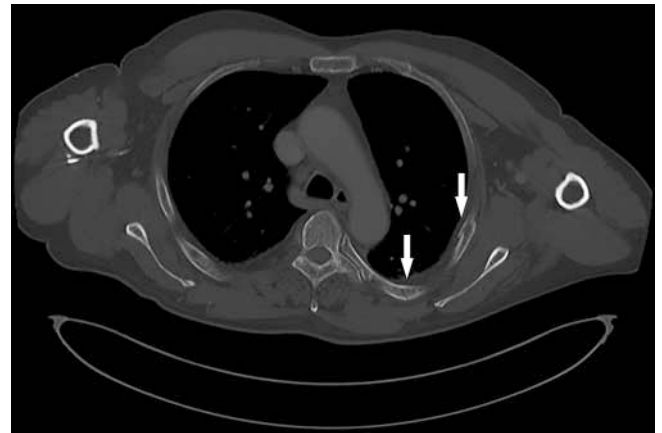
► Fig. 4 Axial CT of the chest displayed in bone window of a 66-year-old male trauma patient. The patient experienced a fall from a height of 2 meters. Slightly dislocated fractures of the 3rd-6th left ribs (white arrows) were missed and classified as a treatment-relevant diagnosis of high clinical significance (BI1).