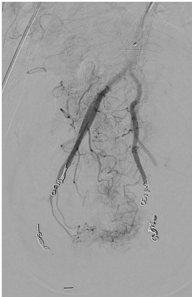
► Fig. 4 Final angiogram. Complete stasis in the distal terminal branches of the superior rectal artery that feed the hemorrhoidal plexus.

ment and improved quality of life in 87.5% of patients. Complications were not observed within the follow-up period of 12 months [27].