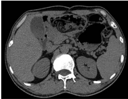
► Fig. 1 Multiple tubular objects in the stomach and duodenum on the computed tomography scan.