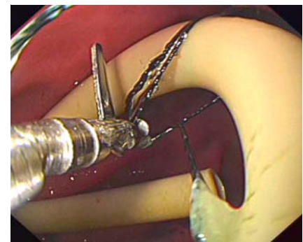
► Fig. 4 Endoscopic scissors were used to successfully cut through the silk line.

A middle-aged man presented to the emergency department with abdominal pain for the past eight days. He disclosed that he had ingested a long plastic tube trapped with a silk line after drinking two years ago. Physical examination was normal, as was his routine blood test. Computed tomography scans showed multiple tubular objects in the stomach and duodenum (► Fig. 1 ). Gastroscopy revealed numerous yellow tubes in the stomach and duodenum (► Fig. 2 , ► Video 1 ). It was observed that one end of the silk line was wedged in the duodenum wall with secondary mucosal ulceration (► Fig. 3 ), and the other end was tightly wound around the tubes in the stomach (► Fig. 2 ). Because the silk line was very flexible, the endoscopy nurse made several attempts before successfully cutting it in half while pulling silk