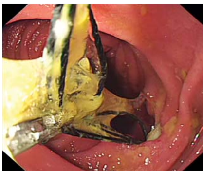
► Fig. 3 Numerous yellow tubes in the duodenum. One end of the silk line was embedded in the duodenal ulceration. Many extraction attempts were made, but the silk line remained in the duodenum.