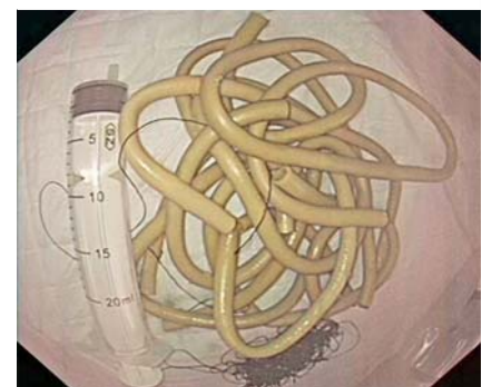
► Fig. 5 All identified foreign bodies (yellow plastic tubes and silk lines) were removed. A 20-ml syringe is pictured as a reference.