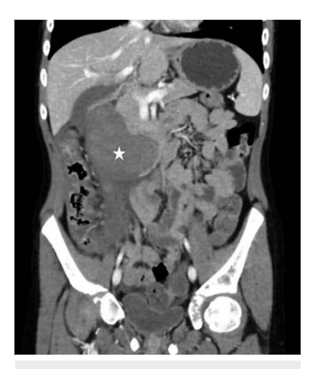
► Fig. 2 Computed tomography scan image (coronal view) showing a large intramural duodenal hematoma (*).

IDH is a very rare complication after endoscopic biopsies, especially in the pediatric population. Its treatment is still debated, but conservative management should be considered the first choice. Furthermore, an accurate anamnesis is fundamental in the diagnostic assess-