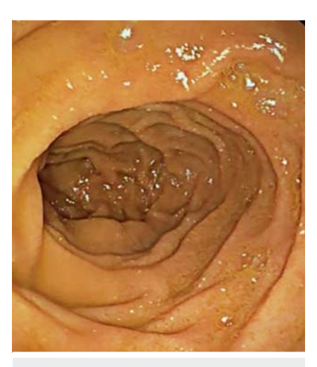
▶ Fig. 1 Duodenal view during the first esophagogastroduodenoscopy prior to biopsies being taken.

On the 15th postoperative day, the nasogastric tube was removed. The day after its removal, the patient tolerated oral feeding, which was then gradually in-