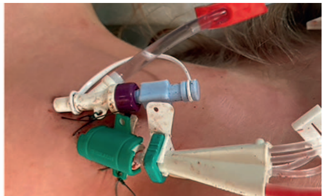
► Fig. 1 Illustration of vascular accesses. Sheaths Right: 18F sheath (white/blue) in the right common femoral vein and 4F sheath (red) in the right common femoral artery. Left: 10F return sheath (white/blue) and central venous catheter (green) in the right internal jugular vein.