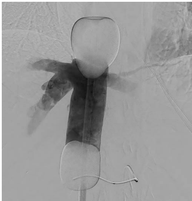
► Fig. 2 Tightness test of the balloon occlusion of the IVC. DSA to check the tightness of the balloon occlusion of the IVC without evidence of leakage.

on has completely normalized. The patients are then usually able to return to the normal ward and can be discharged on the third to fifth post-interventional day. To prevent tumor lysis syndrome, 300 mg/d allopurinol is administered for three days postinterventionally. After discharge (outpatient) laboratory chemical controls are carried out (three times every three days). For control purposes, an MRI with liver-specific contrast agent is performed after 8 weeks. A second session is performed if control shows tumor regression or stable disease. In the authors' treatment center, up to six chemosaturations have been performed in one patient. However, up to eight sessions were reported for one patient; thus it can be concluded that this method is in principle not limited in the frequency of use if therapy is successful and liver function is preserved [4].