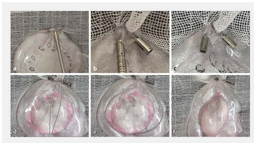
► Fig. 1 Schematic illustration of reopenable-clip band-assisted underwater endoscopic mucosal resection (RB-UEMR). a The reopenable-clip band is placed at the normal mucosa beyond the tumor. b, c The other end of the band is also connected to the mucosa, next to the first clip, to make a trap to hold a snare tip. d, e The tip of a rotatable snare is placed in the trap, and the snare is expanded to its widest. f The entire lesion is captured.

Our patient had a 40-mm sessile serrated lesion (SSL) in the ascending colon. We used RB-UEMR to fix the snare tip and resected the lesion. A reopenable-clip band (Sterile Elastic Traction Device; Micro-Tech Co. Ltd., Nan Jing, China), which is a reopenable clip holding a double-ring band and another reopenable clip (► Fig. 1, ► Video 1), is used for this method. The reopenable-clip band was placed at the normal mucosa beyond the tumor, while the other end of the band was connected to the mucosa next to the first clip to make a trap to hold the snare tip (► Fig. 2). The tip of a rotatable snare (Rotasnare 35 mm; Medi-Globe GmbH, Achenmühle, Germany) was placed in the trap, and the snare was expanded to its widest. The entire lesion was then captured. However, since the snaring of this large mucosal area caused the lesion to bend, a small amount of the lesion was left behind. Additional snaring enabled complete resection of the residual lesion. The mucosal defect was completely closed using the reopenable-clip-over-the-line method [5]. The largest specimen of the lesion had a longest diameter of 46 mm and a shortest diameter of 36 mm, and the histopathological analysis revealed SSL.