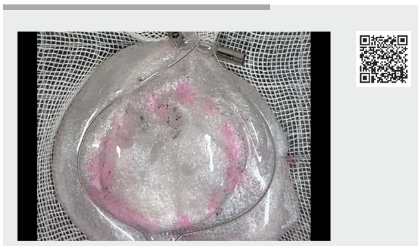
► Video 1 Schematic demonstration and an actual case of resection of a 40-mm sessile serrated lesion using reopenable-clip band-assisted underwater endoscopic mucosal resection.