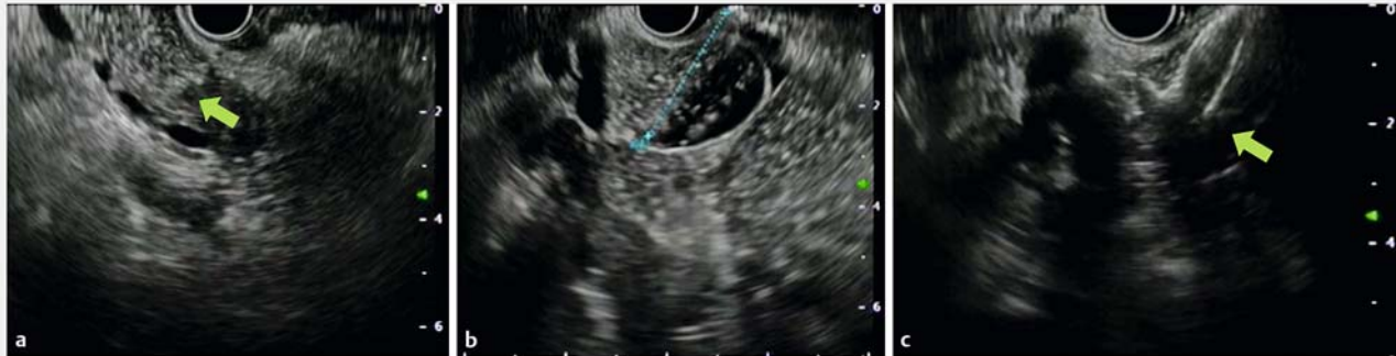
► Fig. 1 Ultrasonographic view of the lesion. a Hypoechoic lesion infiltrating the biliary tract. b Dilated bile duct. c Endoscopic ultrasound-guided choledochoduodenostomy.