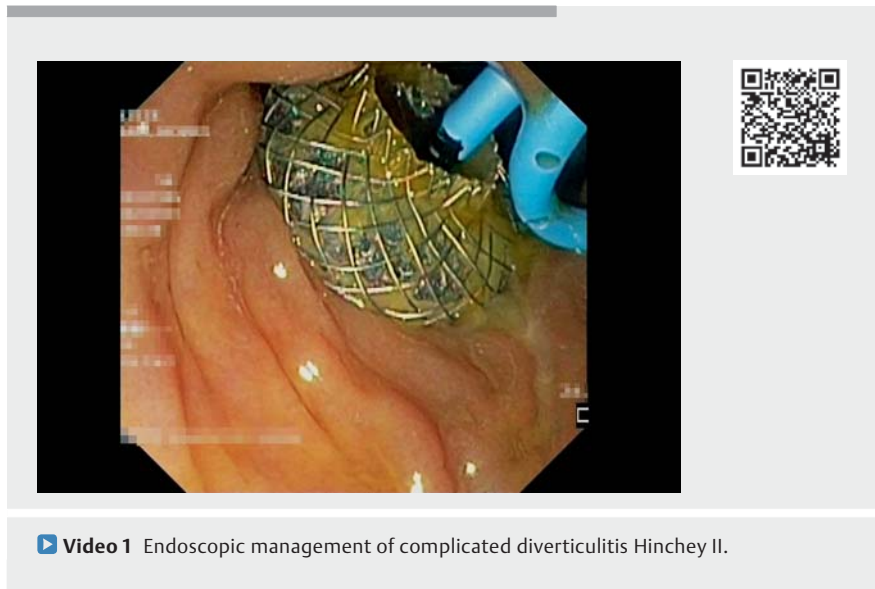
► Video 1 Endoscopic management of complicated diverticulitis Hinchey II.

The diverticulitis-associated abscess was punctured freehand (► Fig. 2a ) using the electrocautery-enhanced LAMS (10 × 10 mm; pure cut mode, effect 4). After