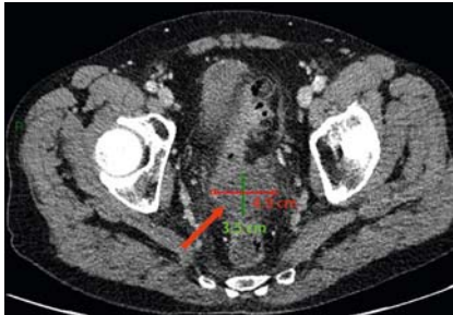
► Fig. 1 Computed tomography scan showing complicated diverticulitis Hinchey II with an abscess (red arrow).

Complicated diverticulitis occurs in 12% of all diverticulitis cases [1]. Radiological drainage is the first-line therapy in cases of large diverticulitis-associated abscess [2]. However, the pelvic location renders the radiological access challenging. Lower endoscopic ultrasound (EUS)-guided drainage, using an electrocautery-enhanced lumen-apposing metal stent (LAMS), is a feasible and safe alternative method for drainage of pelvic collections [3–5]. We present a case of a diverticulitis-associated abscess successfully treated using EUS-guided LAMS.