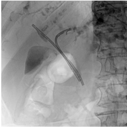
► Fig. 1 Previous bilateral inside plastic stents for malignant hilar obstruction. Previous inside stents were placed over the perihilar obstruction.

Endoscopic bilateral biliary plastic stent placement is considered a viable option for drainage in patients with an unresectable malignant hilar obstruction [1]. Recently, a dedicated inside plastic stent with removal of threads emerged for malignant hilar obstruction, with a longer patency period and easier removal [2,3]. However, the multiple inside plastic stent method harbors the risk of preceding stent migration owing to shear stress caused by the succeeding stents [4]. This article describes tips for preventing preceding stent migration using micro-alligator forceps through the two-devices-in-one-channel method [5].