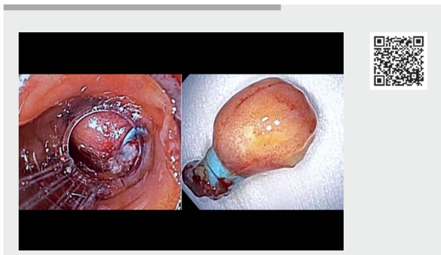
► Video 1 Resection of a subepithelial duodenal lesion using band-assisted endoscopic full-thickness resection using full-thickness resection device.

The lesion was retrieved (► Fig. 1 ). Repeat endoscopy showed the resection to be complete with an intact base with the clip in place (► Video 1 ). Pathology confirmed the lesion to be a GIST with R0 resection.