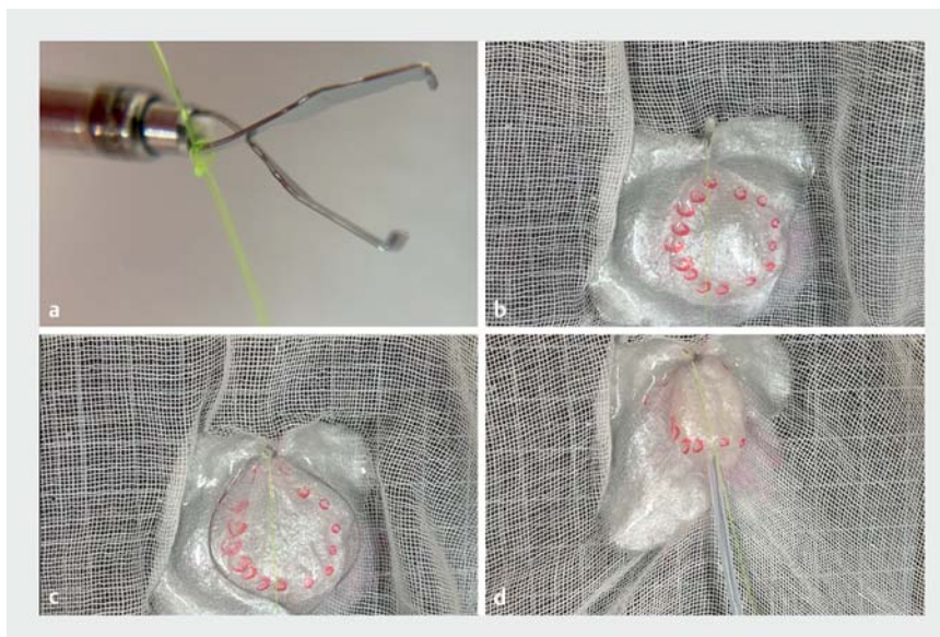
► Fig. 1 Schematic demonstration of clip-line-assisted underwater endoscopic mucosal resection. a Tie a line to the base of the teeth of the clip and insert it through the accessory channel of the endoscope. b Place the clip-line on the anal side at a distance from the lesion. c When the snare expands, pull the line toward the accessory channel and fix the snare tip to the normal mucosa. d Tighten the snare while pushing the sheath of the snare.

Snaring for duodenal adenoma using CLU-EMR is a useful method for fixing the snare tip to the anal normal mucosa.