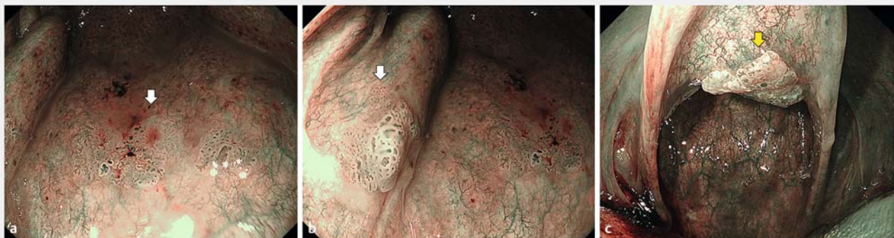
► Fig. 2 Endoscopic images (narrow-band imaging) of the papillary lesions in the nasopharynx a Transoral retroflex view of Lesion #1. b Transoral retroflex view of Lesion #2. c Transoral retroflex view of Lesion #3.