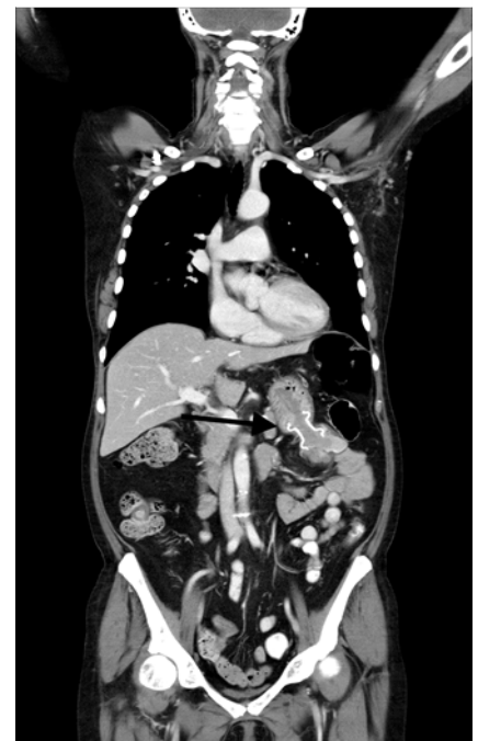
► Fig. 3 Computed tomography scan showing communication between the stomach and colon (arrow).

However, 4 months later, the patient complained of dyspeptic symptoms. Gastroscopy was performed, revealing a normal anastomosis with two jejunal loops (► Fig. 2 , ► Video 1 ). Then, 2 months later, gradual development of anorexia, diarrhea, and fecal vomiting was observed. A computed tomography scan indicated possible communication of the stent with the colon (► Fig. 3 , ► Video 1 ). Gastroscopy showed a patent anastomosis between the stomach and jejunum as well as the large intestine. We extracted