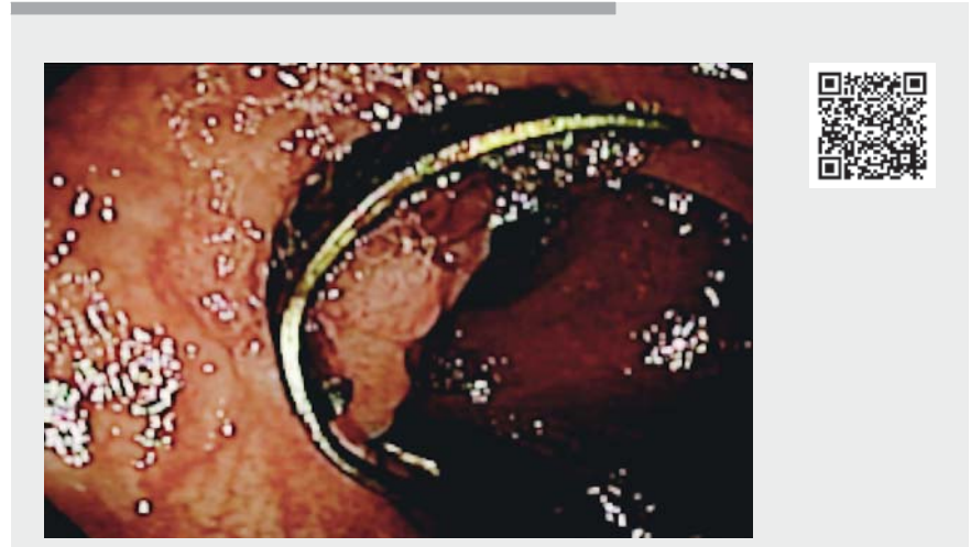
► Video 1 Removal of an over-the-scope (OTS) clip using the OTS clip-removal system before polypectomy of the recurrent polyp is performed.

We present the case of a 64-year-old woman with no significant past medical history who was found during a screening colonoscopy to have a 45-mm sessile polyp at the hepatic angle. The initial resection attempt was complicated by massive spurting bleeding, which was controlled by adrenaline injection and the application of eight hemoclips. During the next colonoscopy, we observed adenomatous tissue with significant fibrosis and decided to perform endoscopic full-thickness resection (EFTR) with a “close and cut” technique using a 14/6t over-the-scope (OTS) clip (Ovesco Endoscopy AG, Tübingen, Germany) [1, 2]. This resection was performed without any complications and the patient was discharged after 24 hours.