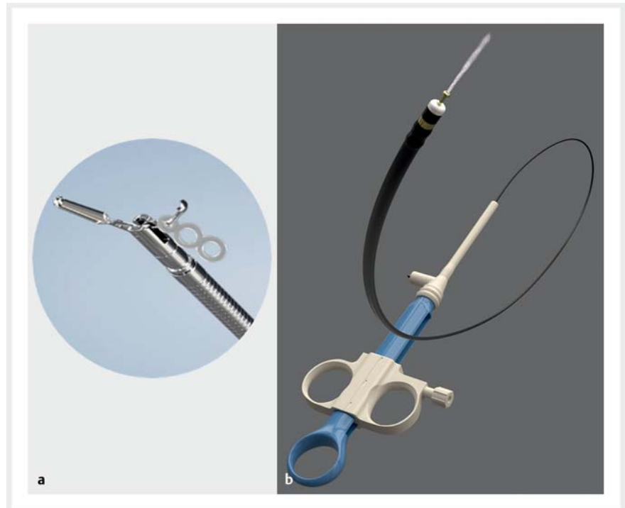
► Fig. 1 The device used in the procedure. a Clip-band traction device. The clip used is reopenable. Because it is reopenable, it can be re-gripped when a point is grasped. The band is made of silicone and can be removed from the clip using grasping forceps. b Mucosal incision and submucosal dissection are performed using a knife capable of local injection. Local injection is administered from the tip of the knife.

In conclusion, the triangle traction method is a technique that forms a triangle with the bridge as the base and the second band fixed at the apex. This method can ensure a more extensive lift of the dissection plane than the simple traction method (► Fig. 2 f ). This easy-to-use method involves clips and a clip-band