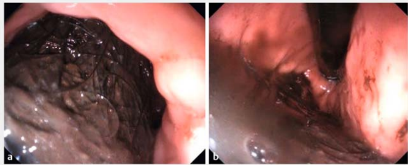
► Fig. 1 Endoscopic images. a Accumulation of hair on the greater curvature and antrum. b In retroflexion.

The treatment of choice is surgical by wide gastrotomy and extraction of the bezoar, although in some cases endoscopic extraction may be attempted. However, for cases where the trichobezoar occupies more than 50% of the gas-