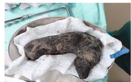
► Fig. 3 The extracted gastric trichobezoar, which had adopted the gastric shape as well as that of a section of duodenum.

The authors declare that they have no conflict of interest.