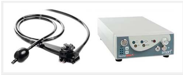
► Fig. 1 Left: G-EYE System. Right: G-EYE balloon integrated on a standard colonoscope NaviAid SPARK 2 C inflation system.

Safety parameters and adverse events (AEs) were assessed during the procedure and by phone call interview during the 48- to 72-hour post-procedure follow-up period.