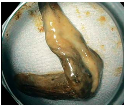
► Fig. 2 The largest specimen removed (9 × 1.5 cm) was sent for histopathological examination, which confirmed a necrotic gallbladder wall.