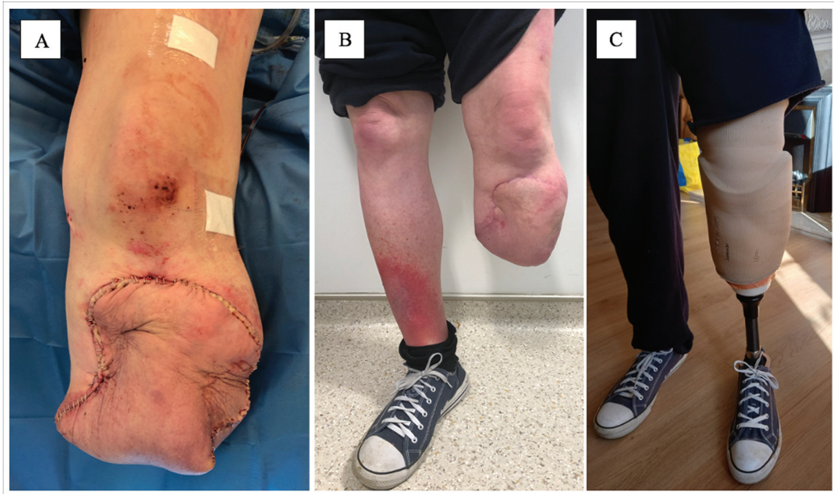
Fig. 3 Below knee amputation (BKA) stump following fillet flap primary closure (A), at 3 months (B) and at 6 months with prosthesis fitted (C).

also excised. Microvascular dissection was performed in layers. Sensate plantar and posterior ankle skin flap up to the midfoot was utilized and the remaining bones and soft tissue from the dorsum and toes was discarded. Peroneal and anterior tibial neurovascular bundles were tied and nerves transected. PT bundle was microscopically dissected toward its distal perforators to posteromedial skin flap and distal tibial periosteum and were preserved. The saphenous, sural, and tibial nerve along with the medial calcaneal branch were kept in continuation preserving direct innervation and therefore sensation of the fillet skin flap. Following tibial debridement and excision, a proximal 6-cm stump of healthy bone tissue and a distal portion of 10 cm of tibial shaft remained. The distal portion was reversed 180 degrees in the sagittal plane and the tibia plafond was fixed to the end of the proximal stump with two 7.3-mm cannulated compression screws, after insertion of absorbable antibiotic beads into the canal. This lengthened the tibial stump from 6 to 16 cm. The posterior skin flap was used to achieve soft tissue coverage with a 2-cm cuff of deep posterior compartment muscle supplied by the tibial bundle to prevent kinking of the turn-over flap during inset. The tibial nerve, saphenous, and sural nerves allow a sensate distal stump.