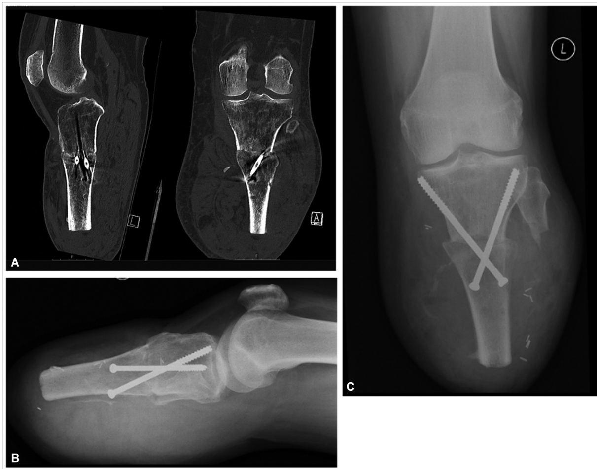
Fig. 4 Computerized tomography (A) and plain radiographs (B, C) at 12 weeks demonstrating bony union.

immobility that would have resulted from contralateral fibula graft harvest from the unaffected leg.