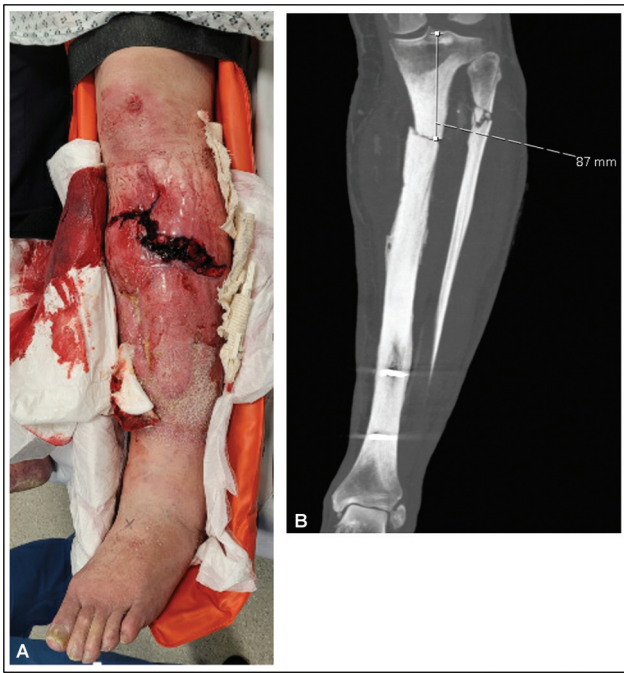
Fig. 1 Clinical (A) and radiological (B) imaging at admission demonstrating an open proximal tibia fracture with compromised soft tissue envelope (A) on a background of chronic osteomyelitis, osteonecrosis, and a pathological tibial fracture (B).

used a modified orthoplastic approach to enhance function by preservation.