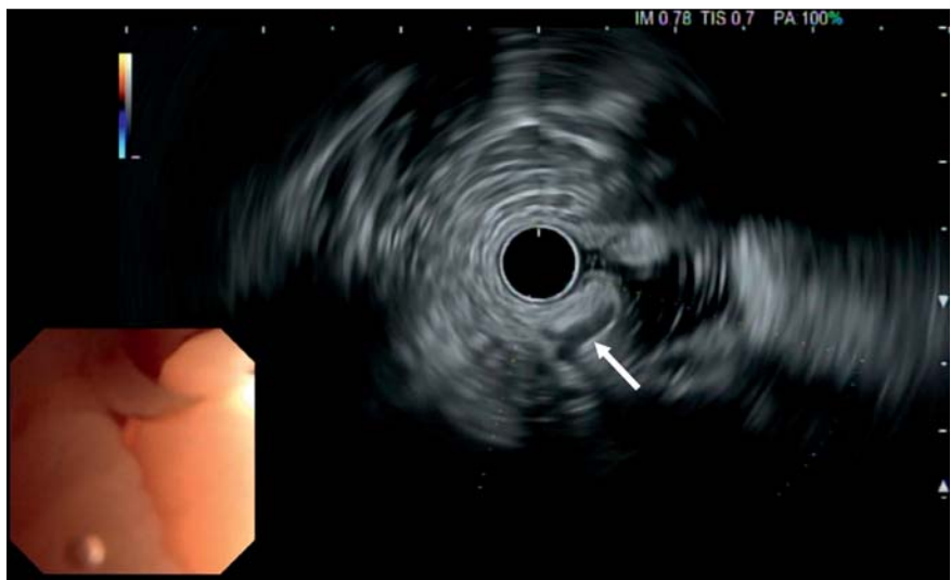
► Fig. 3 Echo-endoscopic view of the lesion showing an atypical anechogenic duct within the lesion, which initially led to the suspicion of an ectopic gland or a fistulated rectal gland.