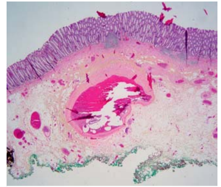
▶ Fig. 4 Histologic view of the lesion (stained with hematoxylin phloxine and safranin). Angiodysplasia consists of dilated, distorted, and tortuous vessels lined by non-atypical endothelium and, here, thick small muscle walls located in the submucosae. Here, the mucosae are normal without inflammation or vessel abnormalities.