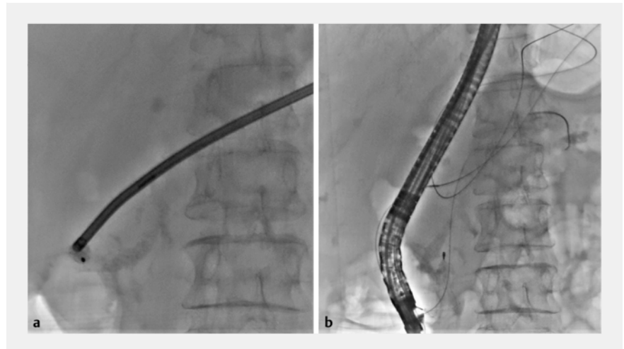
► Fig. 3 a A captured pancreatolith with mechanical lithotripsy being performed. b The basket fractured at the handle portion of the lithotripter and the wires fell into the digestive tract.

A 57-year-old woman presented with recurrent epigastric pain. Computed tomography of the abdomen revealed a 26-mm pancreatic stone obstructing the main pancreatic duct (MPD) in the body portion (► Fig. 1 ). We performed three sessions of extracorporeal shockwave lithotripsy (ESWL) using a third-generation lithotripter (Delta Compact II; Dornier MedTech, Weßling, Germany). Up to 5000 shocks were delivered per therapeutic session on a scale of 1 to 6, with a frequency of 120 shocks/min. Endoscopic retrograde cholangiopancreatog-