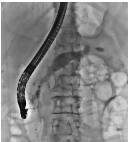
► Fig. 2 The basket with the entrapped stone was impacted within the pancreatic duct at the papilla.

A 57-year-old woman presented with recurrent epigastric pain. Computed tomography of the abdomen revealed a 26-mm pancreatic stone obstructing the main pancreatic duct (MPD) in the body portion (► Fig. 1 ). We performed three sessions of extracorporeal shockwave lithotripsy (ESWL) using a third-generation lithotripter (Delta Compact II; Dornier MedTech, Weßling, Germany). Up to 5000 shocks were delivered per therapeutic session on a scale of 1 to 6, with a frequency of 120 shocks/min. Endoscopic retrograde cholangiopancreatog-