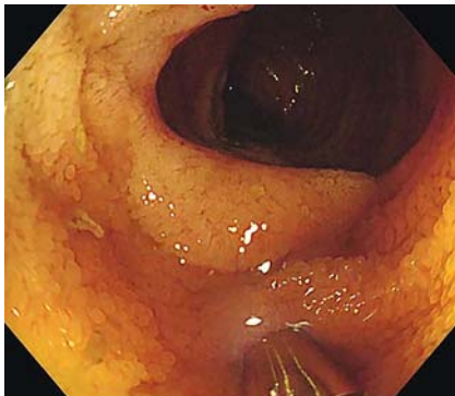
► Fig. 1 White-light endoscopic image showing the terminal ileum, with no obvious lesions visible.

A 35-year-old man was admitted to the hospital with a history of edema and hypoproteinemia for 27 months. Laboratory analysis revealed severe hypoalbuminemia, with a serum albumin level of 1.25 g/dL (normal range 4–5.5 g/dL). Other laboratory and imaging examinations revealed hypoproteinemia with no evidence of protein loss due to renal, hepatic, or autoimmune disease. Capsule endoscopy was performed to confirm there were no lesions in the small intestine and no lesions were visible under white-light endoscopy (► Fig. 1 ).