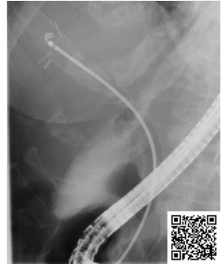
► Video 1 A novel device is used to allow capture of a broken biliary inside stent fragment beyond a biliary duct stricture.