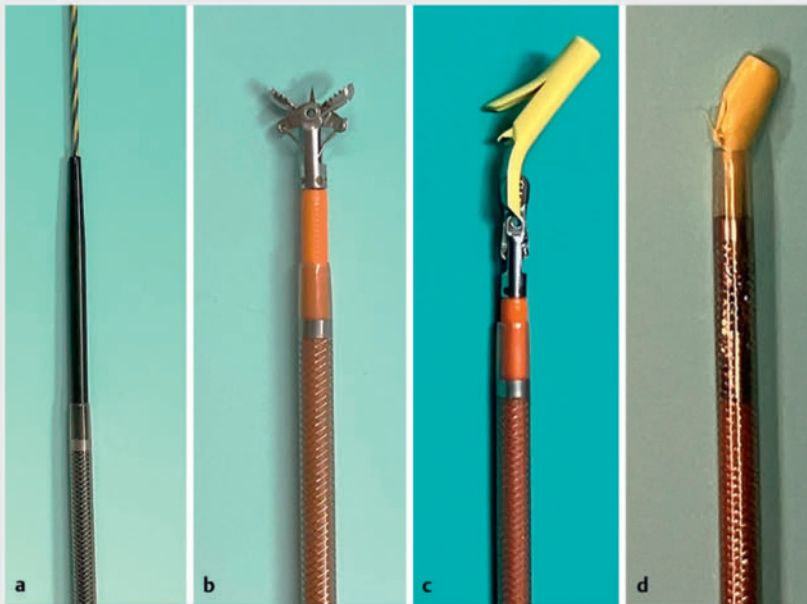
► Fig. 4 Photographs of the novel device showing: a the guidewire passing through the inner catheter; b biopsy forceps inserted through the outer sheath after removal of the inner catheter and guidewire; c the coaxialized stent fragment, biopsy forceps, and outer sheath of the device; d the stent fragment dragged back into the outer sheath of the novel device.