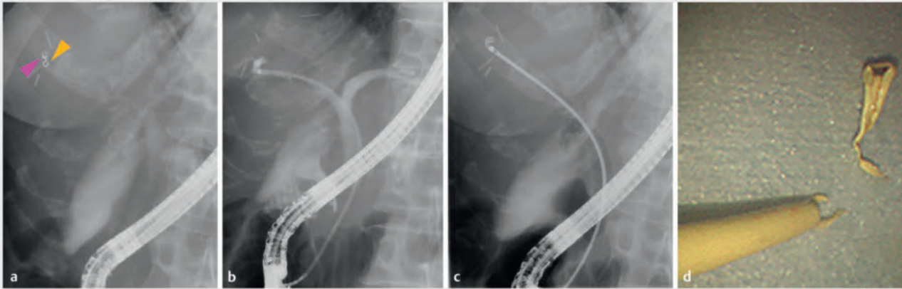
► Fig. 5 Fluoroscopic images (a–c) showing: a the radiopaque marker at the tip of the outer sheath of the device (yellow arrow) positioned just below the stent fragment (pink arrow); b the narrow lumen on the peripheral side of the biliary stricture; c biopsy forceps inserted through the outer sheath to grasp the stent fragment. d Photograph of the removed stent fragment.