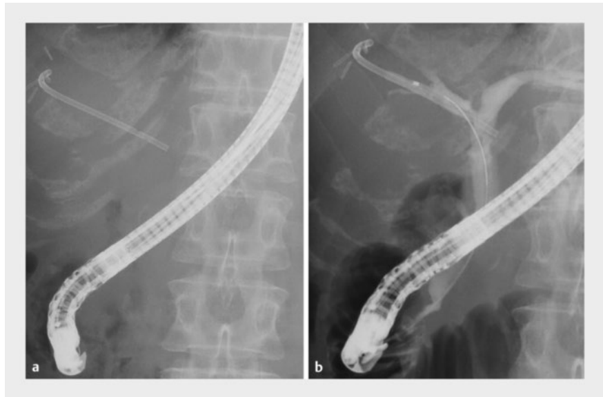
► Fig. 1 Fluoroscopic images showing placement of a plastic biliary inside stent for a benign biliary stricture resulting from a biliary fistula after right anterior segmentectomy.

In patients with hilar biliary stricture, inside stents sometimes migrate and break during the removal process, leaving fragments of the stent in the bile duct, from where their removal is technically challenging [3]. Recent reports have described the removal of foreign bodies from the bile duct using this novel device [4,5]. Notably in this case, the device enabled reliable removal of a floating foreign body in a narrow peripheral bile duct upstream of a severe biliary stricture. This may be a result of the device's stricture-dilating function and its concomitant ability to pull the foreign body out coaxially, enabling the removal of floating foreign bodies that are difficult