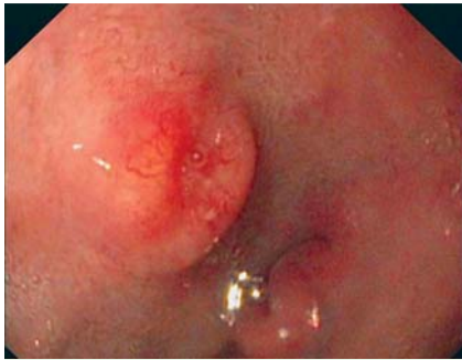
Fig. 1 Upper gastrointestinal tract endoscopy showed a round lesion covered by normal mucosa with a central depression, located in the posterior duodenal bulb.