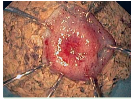
Fig. 5 Macroscopic view of the resected carcinoid.