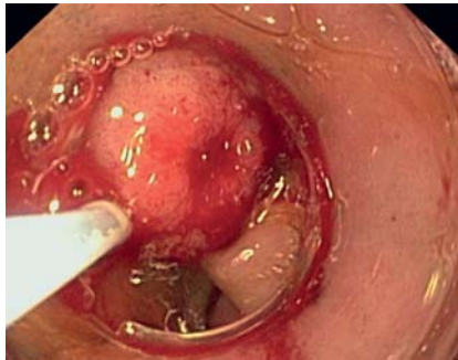
Fig. 3 Endoscopic resection of the carcinoid tumor, using the cap technique.