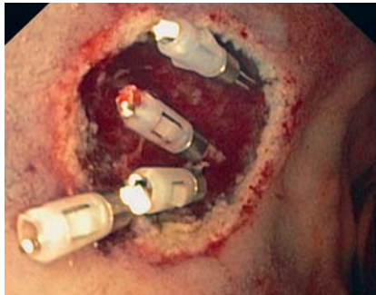
Fig. 4 Bleeding controlled with an epinephrine injection and placement of four metal clips.