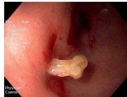
Fig. 2 Closed Hem-o-lok clip seen in the first part of the duodenum (after washing).

This is a unique cause of upper gastrointestinal bleeding. Laparoscopic cholecystectomy is a very common operation and Hem-o-lok clips are used quite frequently for clipping the cystic artery and cystic duct. The erosion of Hem-o-lok clips into the duodenum has not been reported in the available literature. Surgeons must be aware of this unique complication, which also needs to be studied further and evaluated in the interest of patient safety.