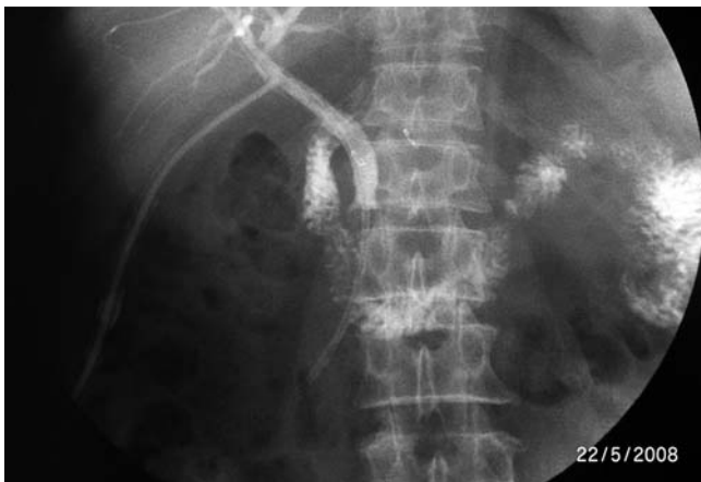
Fig. 1 T-tube tract cholangiography revealed the distal end of the biliary stent located 10 mm into the duodenal lumen.