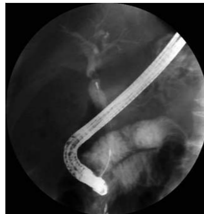
Fig. 6 Cholangiography disclosed severe filling defects in the common bile duct.

Endoscopic biliary stenting has become a principal management option in the treatment of pancreaticobiliary disease. Long-term complications include occlusion, migration, and dislocation [1–3]. Duodenal perforations caused during stent migration are rare but life-threatening [4], with complications including peritonitis, sepsis, retroperitoneal abscess, and duodenal fistulization [4–5]. This report describes an asymptomatic case of duodenal perforation caused by distal stent migra-