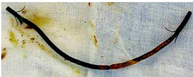
Fig. 4 The plastic stent was found to be obstructed.