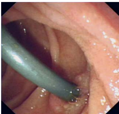
Fig. 2 The distal part of the stent was found to protrude through the contralateral bowel wall of the duodenal papilla.