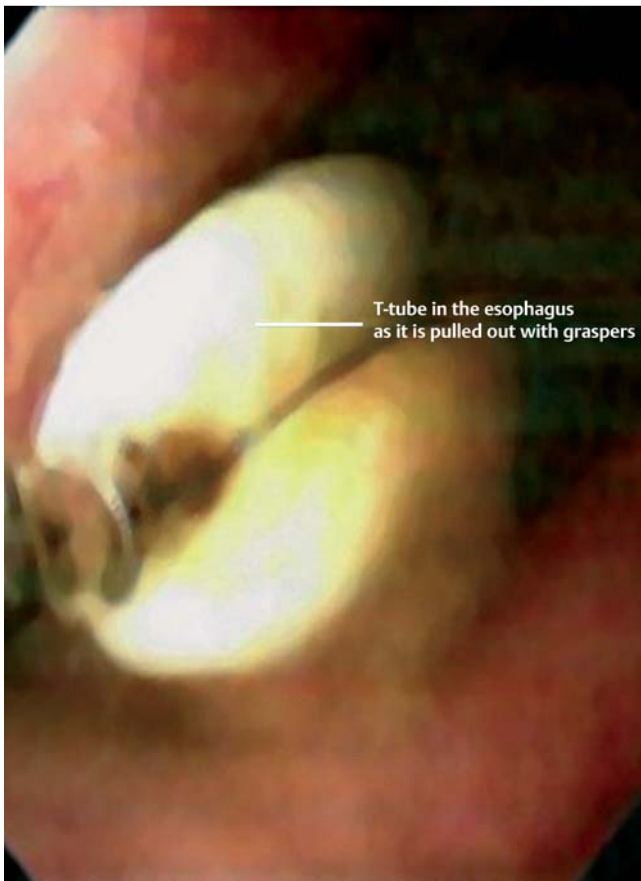
Fig. 3 Endoscopic view of the grasped T-tube being pulled out of the esophagus.