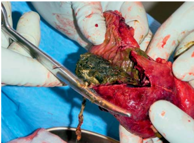
Fig. 3 The stent being removed through an incision in the right fossa.

The patient then underwent another gastroscopy. The defective stent was removed, and the perforation, which was estimated to be just over 1 cm in diameter during the endoscopy, was located and, through the working channel of the gastroduodenoscope, a covered proximal release metal stent with a 90-mm long cover, designed for treatment of malignant strictures in the esophagus (100 × 23 mm Boston Ultraflex), was placed with the distal end in the third part of the duodenum. Following this procedure, the leakage reduced quickly.