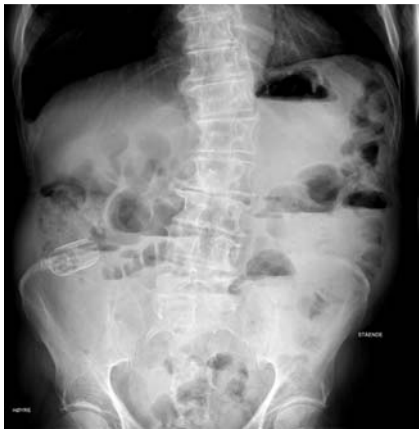
Fig. 2 Radiographic image of the stent in the right fossa with signs of intestinal obstruction.

There are several choices for a reoperation required because of persistent leakage from perforated ulcers or if the perfora-