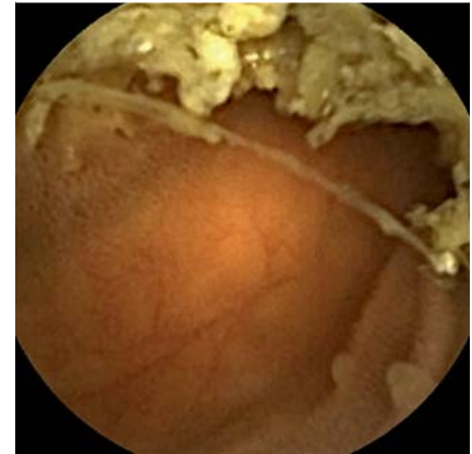
Fig. 2 Image captured by capsule endoscopy at the site of stagnation.