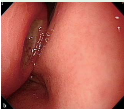
Fig. 1 a, b Upper endoscopy showing a broad-based, protruding mass, approximately 5.5 cm in size, in the anterior wall of lower gastric body. The tumor is accompanied by bridging folds and two deep ulcerations on the surface.