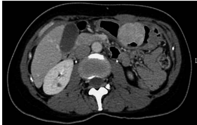
Fig. 2 Abdominal computed tomography (CT) scan demonstrating a strongly enhancing mass, approximately 5.5 cm in size, with surface ulceration, arising from the submucosal layer of the anterior wall of the lower gastric body.