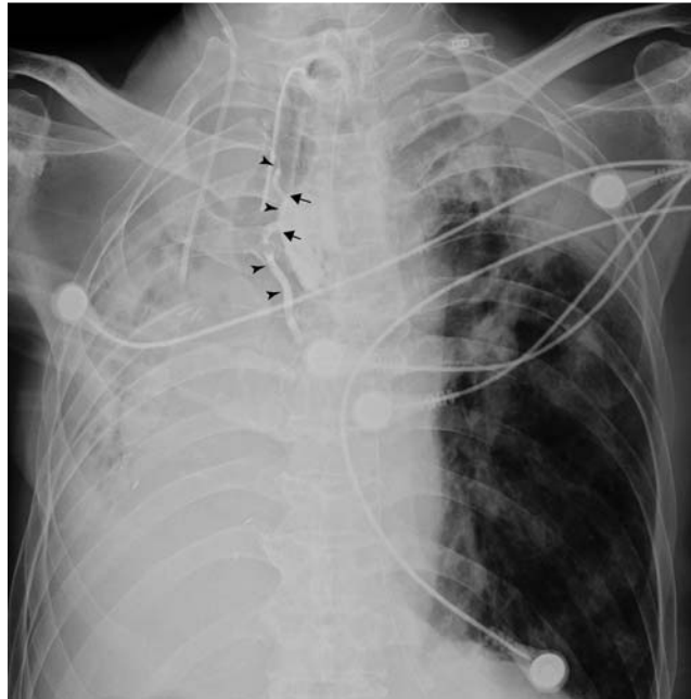
Fig. 4 One vessel (arrowheads) formed a fistula with the mid esophagus (arrows). The tip of the tracheostomy tube impacted the tortuous trachea, externally compressing the azygos vein and mid esophagus.

A bedridden 72-year-old man presented with massive hematemesis; esophagogastroduodenoscopy (EGD) at a local clinic revealed esophageal ulcer bleeding. After