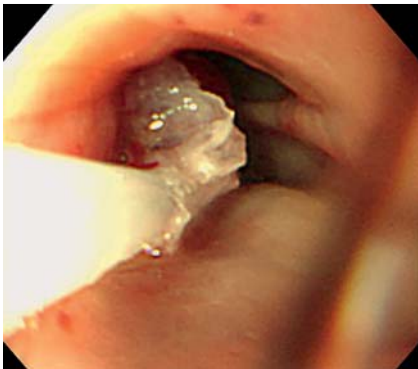
Fig. 3 N-butyl-2-cyanoacrylate and Lipiodol was injected in the erosive base. The lesion was covered with a crystal-like coating and hemostasis was achieved.

A bedridden 72-year-old man presented with massive hematemesis; esophagogastroduodenoscopy (EGD) at a local clinic revealed esophageal ulcer bleeding. After