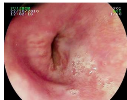
Fig. 3 Normal esophageal mucosa seen at the control endoscopy 5 days later.