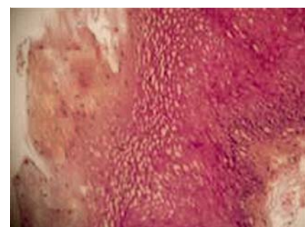
Fig. 4 Reduction in epithelial parakeratosis after therapy (hematoxylin and eosin stain).