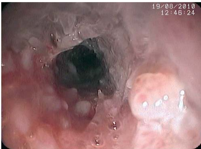
Fig. 2 Esophageal lumen after removing the stent mesh with foreign body forceps.