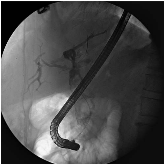
Fig. 1 Cholangiogram revealing a large stone in the common bile duct.

we have had to very often send it back to the company for repair. Therefore, overtube-assisted direct peroral cholangioscopy using an ultra-slim gastroscop was the preferred intervention in this patient. Before the procedure, we made a hole at 70 cm from the distal end of the overtube of a single-balloon enteroscope (ST-SB1, Olympus, Tokyo, Japan) [1,2] (▶ Fig. 2). Then, an ultra-slim gastroscop (GIF-N260; Olympus, Tokyo, Japan) with a 2-mm working channel and 5.9-mm outer diameter was inserted through the hole. In the next step, first the CBD was cannulated with a duodenoscope using a sphincterotome and 0.035-inch jag wire, and then the duodenoscope was replaced with the ultra-slim gastroscop with the overtube over the wire. The overtube was advanced over the scope into the antrum. The overtube was useful for keeping the endoscope straight when inserted in the stomach as it prevented loop formation during advancement of the scope at a more accessible angle to the papilla. Then, without balloon inflation, the gastroscop was supported by the overtube and advanced over the wire into the bile duct (▶ Fig. 3). The CBD stone was visualized (▶ Fig. 4) and EHL was carried out to break the stone into several pieces. The stone fragments were removed using a