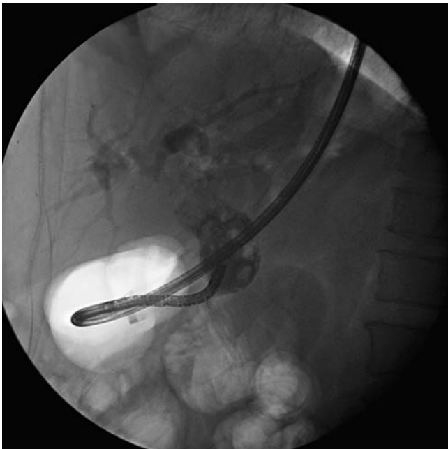
Fig. 3 The ultra-slim gastroscop in the common bile duct; note that the balloon was not inflated.