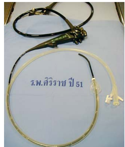
Fig. 2 The overtube with a hole at 70 cm from the distal end.