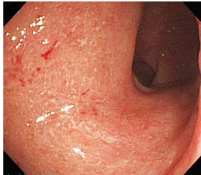
Fig. 1 Colonoscopic findings of diffuse edema, hyperemia, erosion, and granular mucosa from the rectum to the cecum.

A 66-year-old man had a 2-month history of bloody diarrhea. Except for partial gastroduodenectomy because of a duodenal ulcer, the subject was healthy and was not taking any regular medication. He had not recently visited any foreign countries. Physical examination was unremarkable. Routine laboratory tests and complete blood analysis were normal. Total colonoscopy was performed after standard bowel preparation, without sedation. Colonoscopic findings revealed diffuse edema, hyperemia, erosion, and granular mucosa from the rectum to the cecum (Fig. 1).