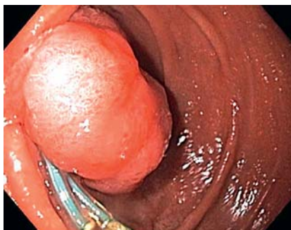
Fig. 3 Residual gastric heterotopia following two attempts at piecemeal resection and detachable snares.

treatment with piecemeal resection was unsuccessful for our patient, it remains a potential therapeutic option.