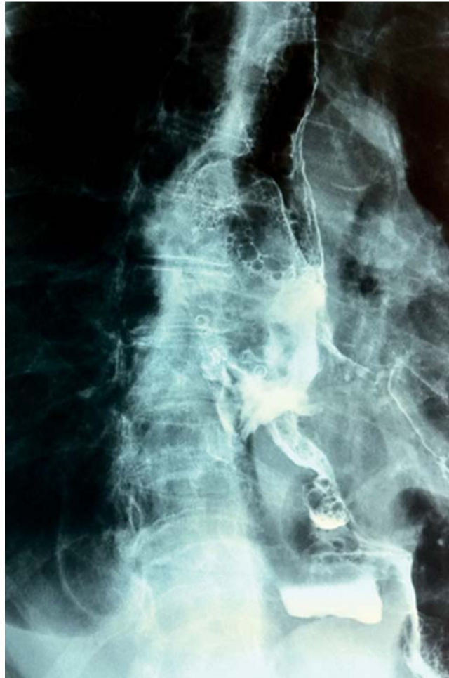
Fig. 1 Esophagogram showing multiple air bubbles in the upper esophagus with passage of contrast into the bronchial tree, and distal stenosis with a sliding hiatal hernia.

Q. Arroyo 1 , F. Argüelles-Arias 1 , M. Jimenez-Saenz 2 , J. M. Herrerias-Gutierrez 2 , F. Pellicer Bautista 3