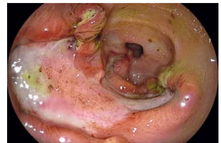
Fig. 3 Endoscopic view of the enormous gastric ulcer in place of the intramural hematoma after 5 days of conservative treatment.