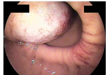
Fig. 2 Formation of large gastric intramural hematoma following submucosal saline injection.