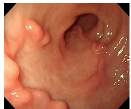
Fig. 4 Endoscopic examination 3 months later showing gastric scar.